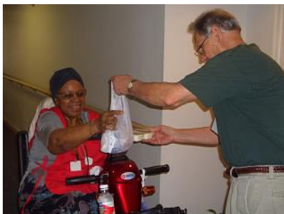
The average Meals on Wheels recipient is a female, over the age of 80 that lives alone.