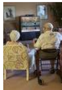
Many seniors depend on their televisions to keep them connected to the world.