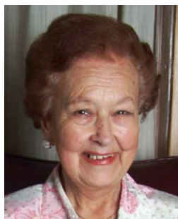
Seniors in the Meals on Wheels for Greater Houston program are homebound and suffer chronic loneliness.